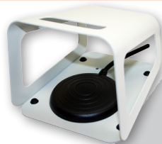
With 6202 Guard